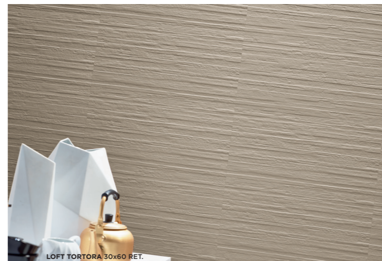
LOFT TORTORA 30x60 RET.