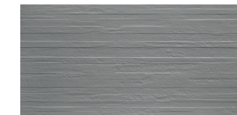
LOFT GREY 30x60 RET. 31x62 LM-3320 LM-3215