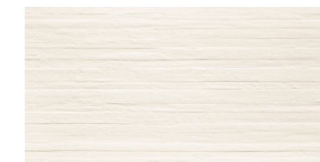
LOFT WHITE 30x60 RET. 31x62 LM-3320 LM-3215