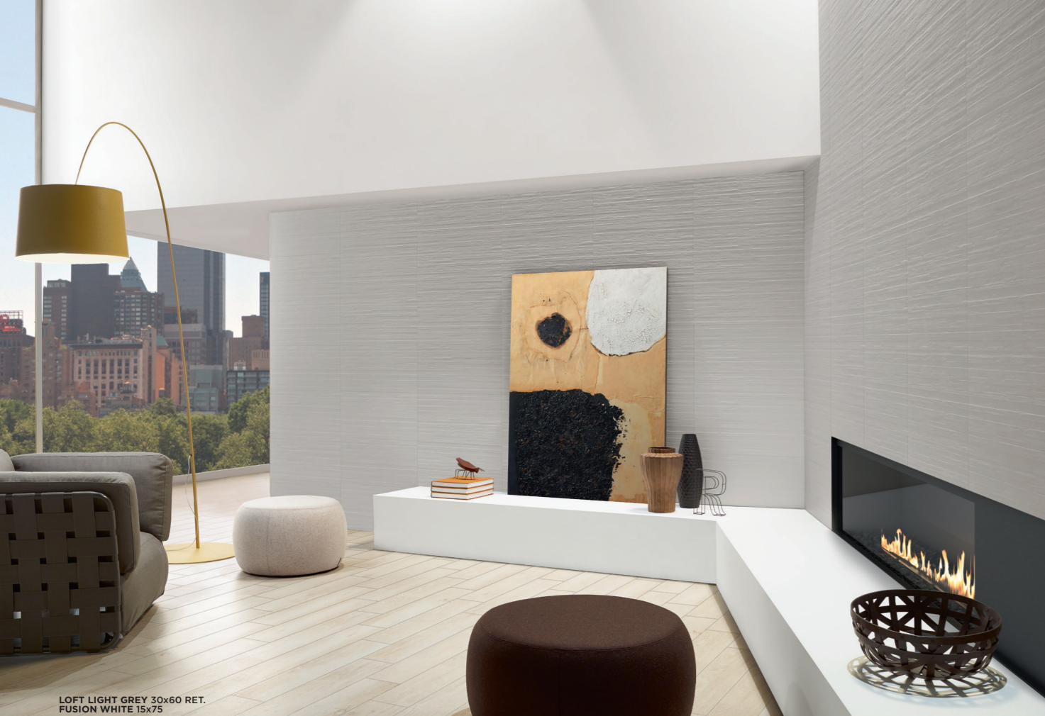
LOFT LIGHT GREY 30x60 RET. FUSION WHITE 15x75