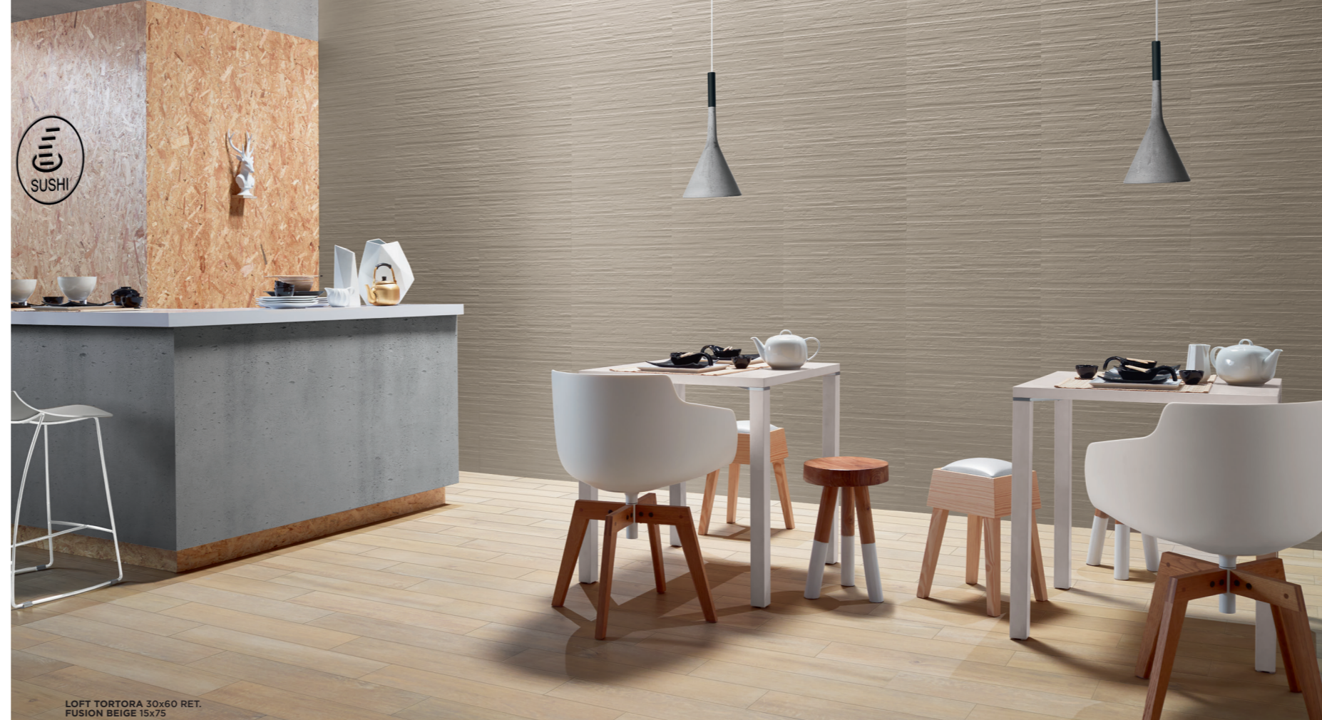
LOFT TORTORA 30x60 RET. FUSION BEIGE 15x75