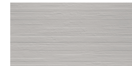
LOFT LIGHT GREY 30x60 RET. 31x62 LM-3320 LM-3215