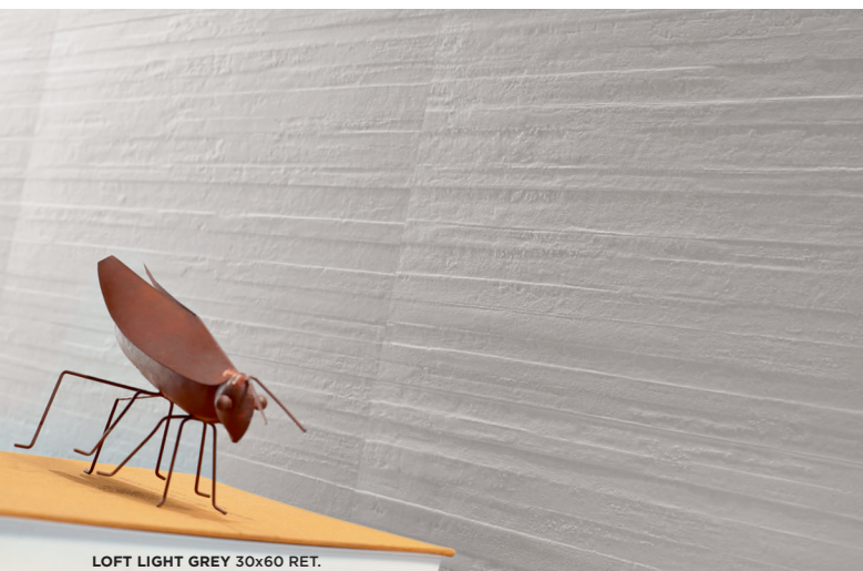
LOFT LIGHT GREY 30x60 RET.