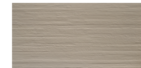
LOFT TORTORA 30x60 RET. 31x62 LM-3320 LM-3215